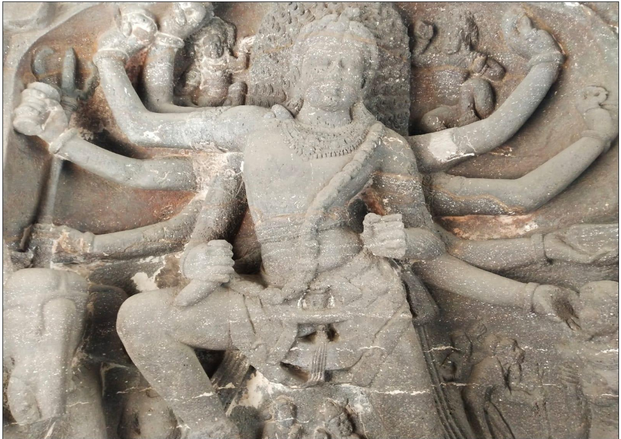
Fig 3: Shiva is slaying the demon Andhaka. Gajasamharamurti - Cave 16