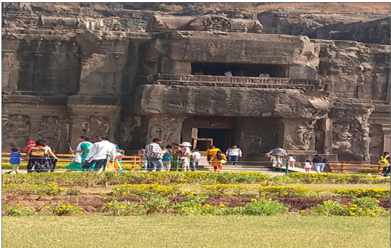
Fig 2: Short view of the great Kailasa temple - Cave 16,

famous for his tandavas which are 7 types. Out of these 7, Samhara tandava is naturally sculpted in Kailasa temple in the name of Gajasamharamurthi as shown in Figure 3.