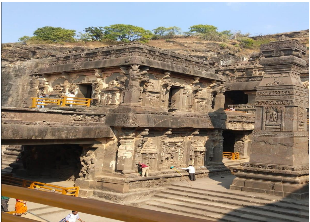
Fig 4: Kailasa temple. Mid-view showing Rang mahal and Shikhara - Cave 16