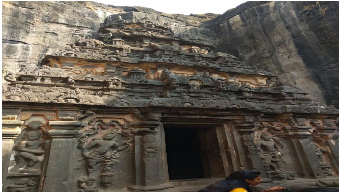
Fig 5: The Kailasa Temple, Kailasanatha, Ellora caves - Cave 16

Kailasa temple is well known for its immense and minute sculptures which extend on the hills and the walls. Figure 5 and Figure 6 give a mid-view showing Ranga Mahal and Shikhara.